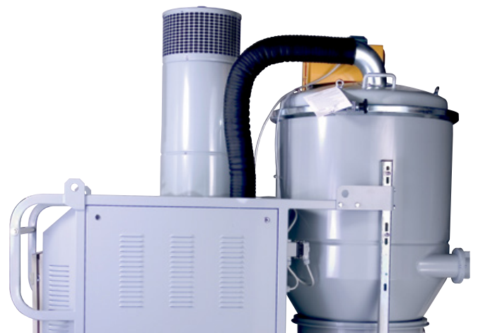
Air outlet diffuser