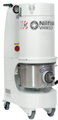
Three-phase up to 4 kW