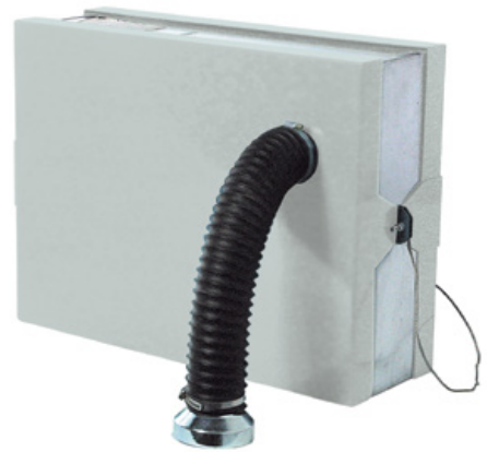
Downstream HEPA filter