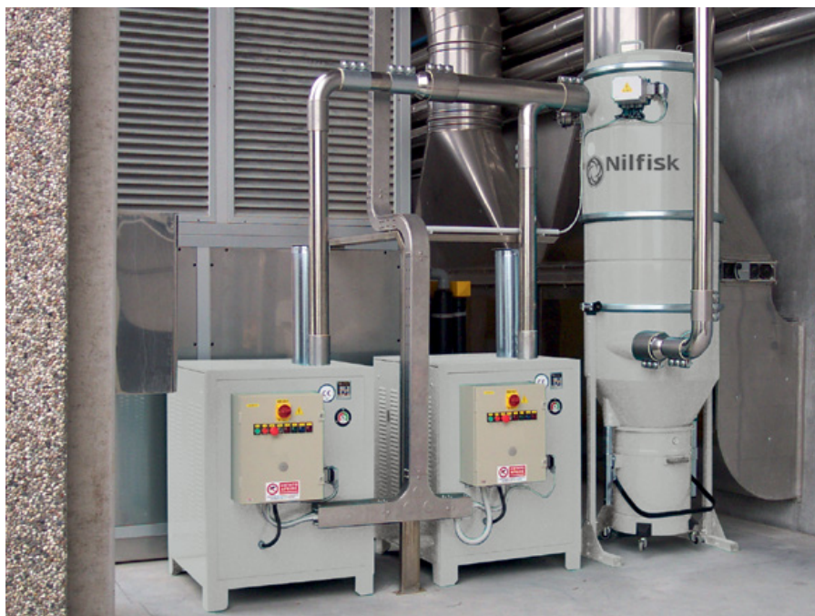
Centralised vacuum system in a chemical company: 2 vacuum units, 1 filter silo.

Centralised vacuum systems are the ideal solution for vacuum applications required in several places simultaneously, and in large environments that may have very different features. ATEX certified systems are often the only choice for large industrial production.