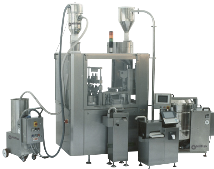
Pneumatic conveyor (left) and capsule pusher (right), in a pharmaceutical company.

Pneumatic conveyors are designed to transport powders and granules from one point to another without changing the mix. These systems are often used to feed automatic machines. The ATEX versions abide by the safety standards used in food production and the chemical-pharmaceutical industry.