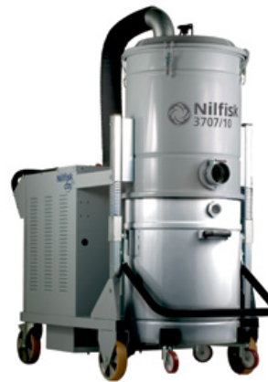
7.5 kW three-phase up to 18.5