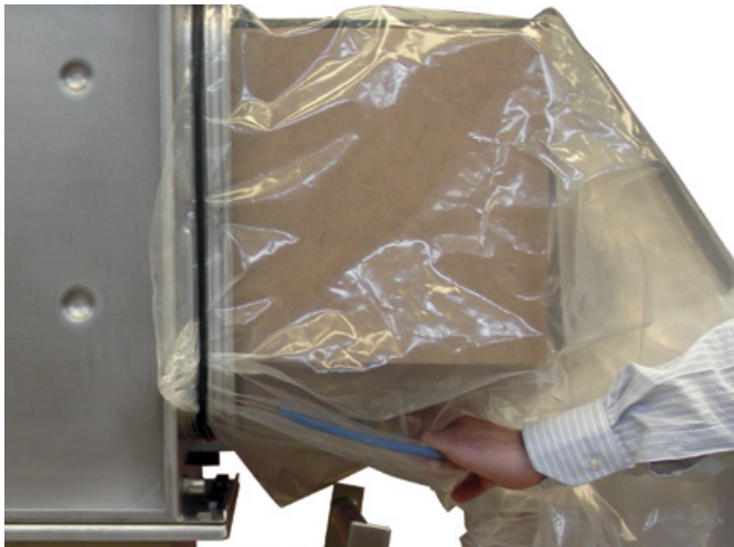
Bag-In Bag-Out filter system