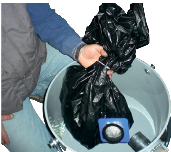
Safe Bag filter