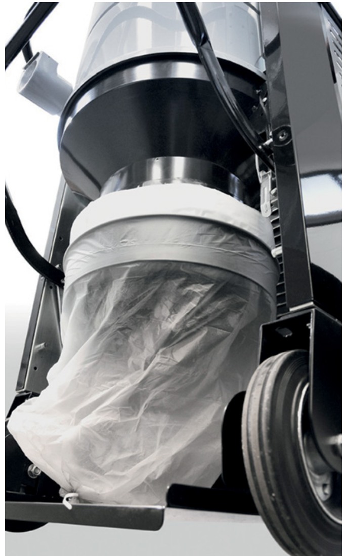
Longopac® "endless" collection system

For more information send an e-mail to marketing.uk@nilfisk.com or visit our website www.nilfisk.co.uk .