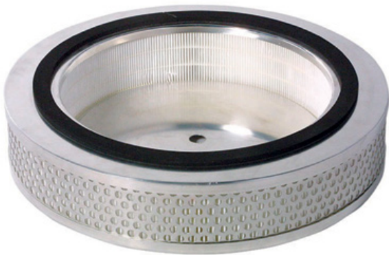
Upstream absolute filter

Visit the site www.nilfisk.com for a free accessories catalogue, including optionals and separators for your vacuum: you'll find the perfect solution to meet your own specific requirements.